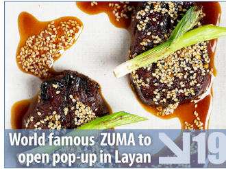
World famous ZUMA to open pop-up in Layan