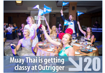
Muay Thai is getting classy at Outrigger